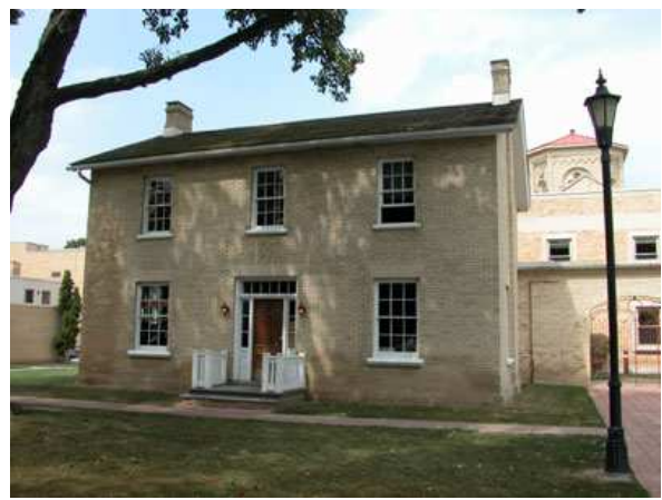
[Gaol Governor's House; soon to be the home of the County of Oxford Archives]