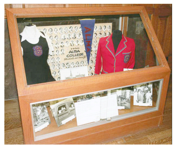
Members of the Alma College International Alumnae Association toured the exhibit and the Legislative Assembly building in mid-September as Speaker Peters' guests.

From April to September, 2009, the Archives mounted an exhibit documenting the history of Alma College as part of the Legislative Assembly of Ontario's Community Exhibits Program. The exhibit featured photographs and documents from the Archives' collection, student uniforms from the Elgin County Museum collection, and a 1936 composite class photograph made available through the generosity of the Archives' long-term community partner, the Alma College International Alumnae Association. The Archives was particularly pleased to facilitate this exhibition during MPP Steve Peters' tenure as Speaker of the Legislative Assembly. Mr. Peters once acted as a volunteer archivist for Alma College and he is a keen supporter of the Community Exhibits Program.