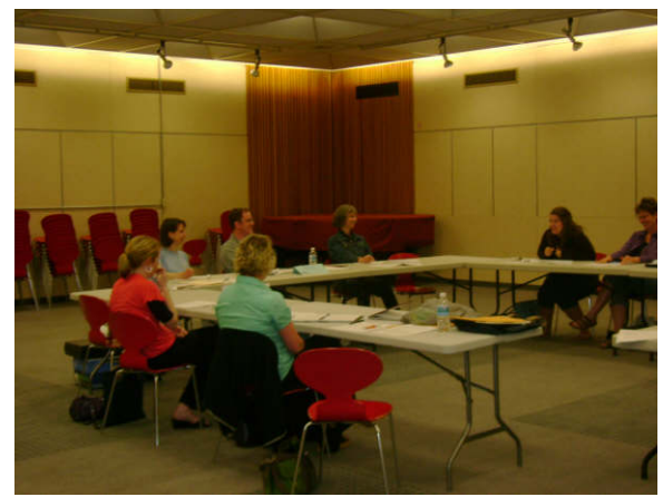
2008 MAIG Annual Meeting Windsor Public Library

In the meantime, I hope to see you at the Open House. And thank you for your support of municipal archives over the years.