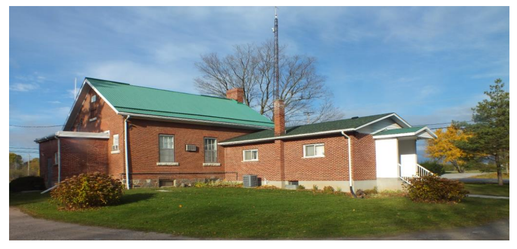
The Trent Valley Archives showing the original school house and the Council Chambers addition.

TVA operates in some ways as a county archives would, but its independence has permitted it to highlight the importance of letting researchers successfully access records, historical documents, photographs, newspapers and books with some degree of ease. We pursue sound archival principles of appraisal, organization and preservation. We stress the importance of historical research and genealogical research. We accept donations from people who have significant things to share and offer fair market value appraisals supported by receipts for income tax purposes.