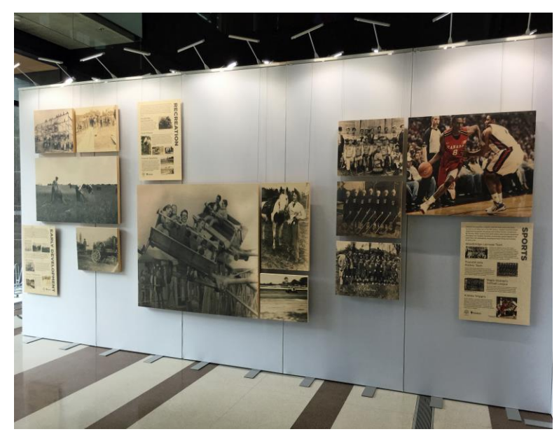
The completed "Our Stories: 150 Years of Vaughan History" Exhibition on display at the City of Vaughan until the end of October 2017.

Like the history of Canada, the history of Vaughan can be found in a rich collection of stories that, when woven together, form the fabric of its identity. Although it is impossible to tell an entire story in one exhibit, the images pay tribute to a small but nevertheless a significant handful of people, places and events that have shaped and continue to shape Vaughan's culture and society with their own unique stories.