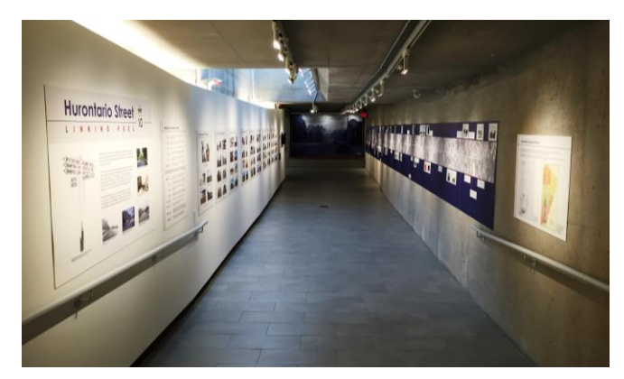
The completed exhibit "Hurontario Street: Linking Peel" (left: Exhibit Signage, right: Scale of Exhibit.

The planning and development of the exhibit seemed all consuming at various points during the process, as the scale and rhythms of a project grew larger over time. Nevertheless, the collaborative efforts of staff from the Archives and Museum paid off and the exhibit was very well received.