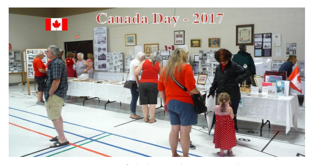
Visitors viewing MCA's displays in Delaware on Canada Day.

Middlesex Centre Archives (MCA) has been busy with the local Sesquicentennial Events. Already in June, volunteers created exhibits for the annual Poplar Hill Picnic. Each year the municipalities of Delaware, Komoka and Mount Brydges hold an annual picnic alternating the location of the event. This year, MCA was in the midst of the Del-Ko-Brydge celebration, which was held this year in Delaware at the Community Centre. At the same time displays were set up in Bryanston. Volunteers created exhibits for these events and talked to many people about the history of the area. The following weekend was the Sesquicentennial Celebration for Ilderton. For pictures of the events please visit our website: http://middlesexcentrearchive.ca/event-photos/.