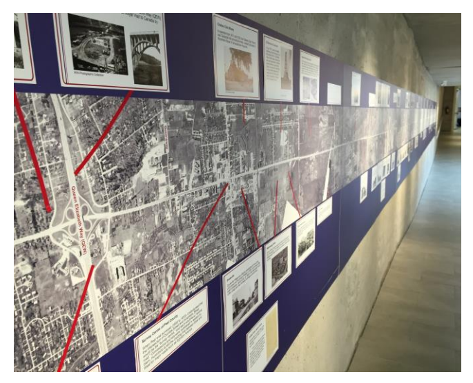
The 50-foot long aerial composite of Hurontario Street.

The Archives has mounted various exhibits in recent years using our reading room. But none of these projects broached the size and scale of "Hurontario". A focal point of the exhibit was a 50-foot-long digital aerial composite image of Hurontario Street extending some 60 km, from old Port Credit (Mississauga) to Orangeville. The composite was painstakingly stitched together digitally using more than 90 separate aerial photos that were originally taken on numerous flight paths from the mid 1960s into the early 1970s.