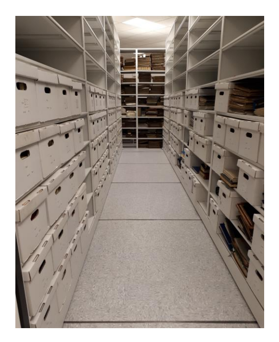
The new look of the Lambton County Archives storage space.

While our collections storage area was completely empty, we seized the opportunity to remove the carpet and refinish the concrete. Although bringing in a separate contractor to work on the flooring tightened our timelines (and increased our headaches), it was important to take advantage of the vacant space and address an ongoing issue.