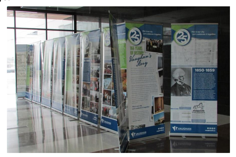
Part of the 166 Years of History: Vaughan's Story display set up in the City Hall Atrium (members of the community were able to walk around the entire display and view the decades at their leisure).

From April to June, 166 Years of History: Vaughan's Story was displayed prominently in Vaughan City Hall's Atrium, as well as showcased online through various social media channels. For the remainder of the year, the exhibit will travel to various libraries and community centres throughout Vaughan, complementing the ongoing City celebrations and events continuing throughout the year.