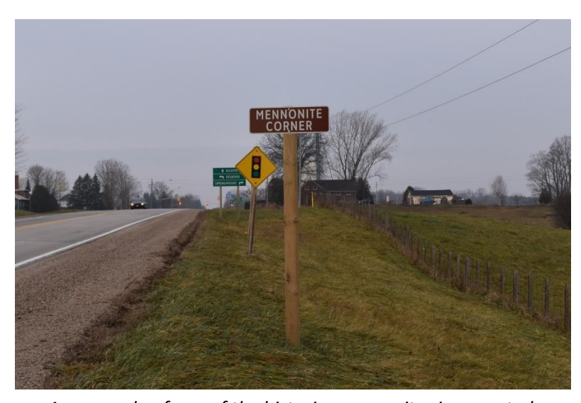
An example of one of the historic community signs posted at Grey Road 18 and Grey Road 5.